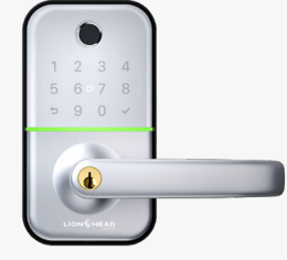
LHL-P3-S-CARLISLE BLACK / SILVER