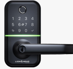
LHL-P3-B-CARLISLE FULL BLACK